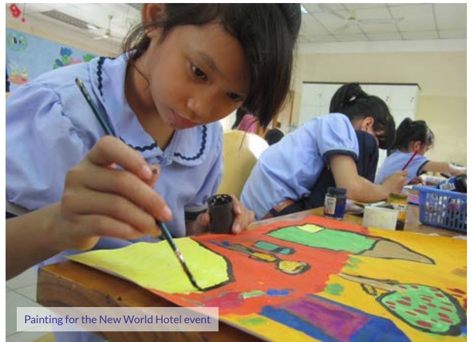
Painting for the New World Hotel event