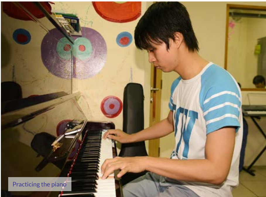
Practicing the piano