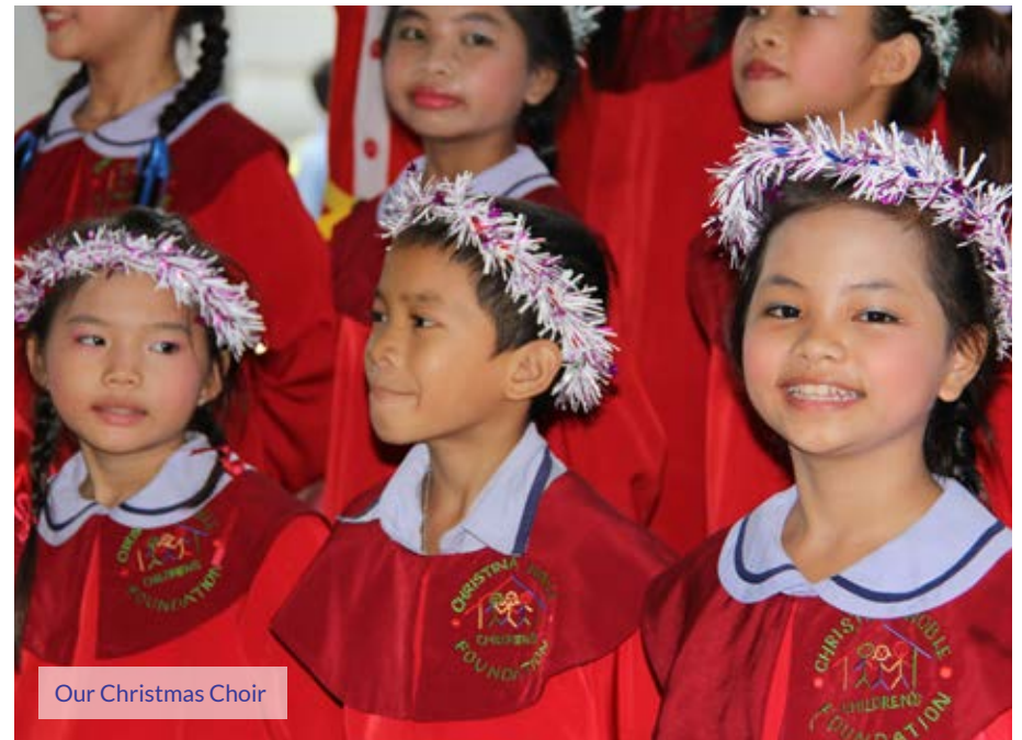
Our Christmas Choir