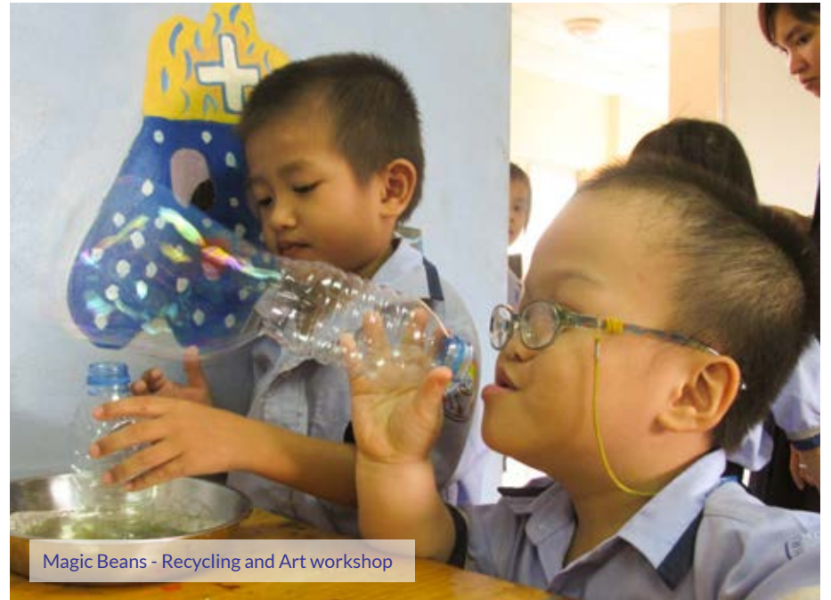
Magic Beans - Recycling and Art workshop