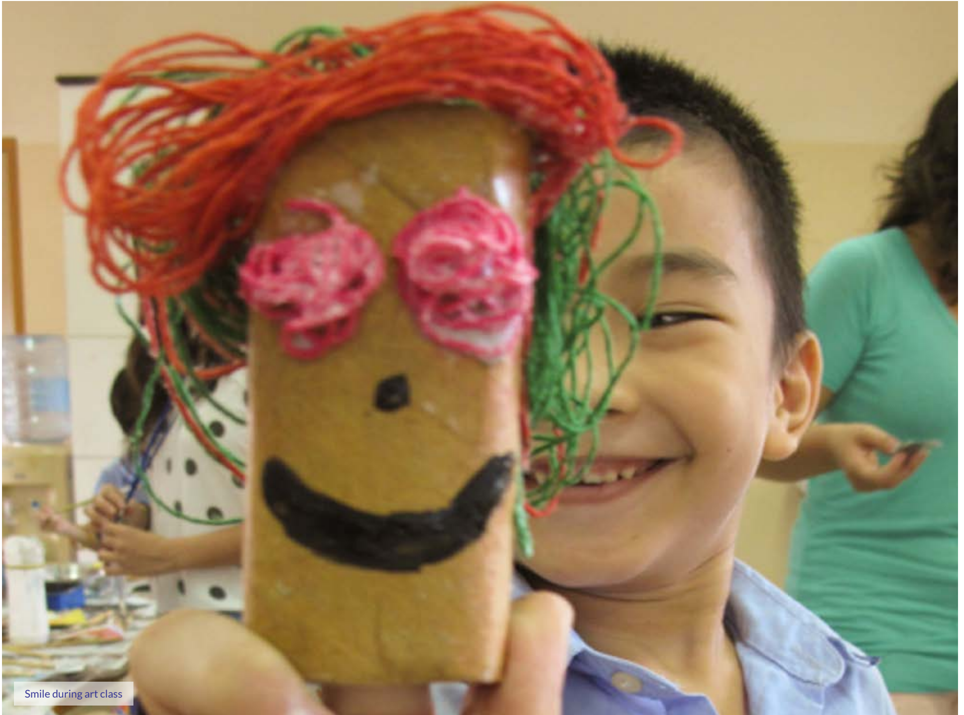
Smile during art class