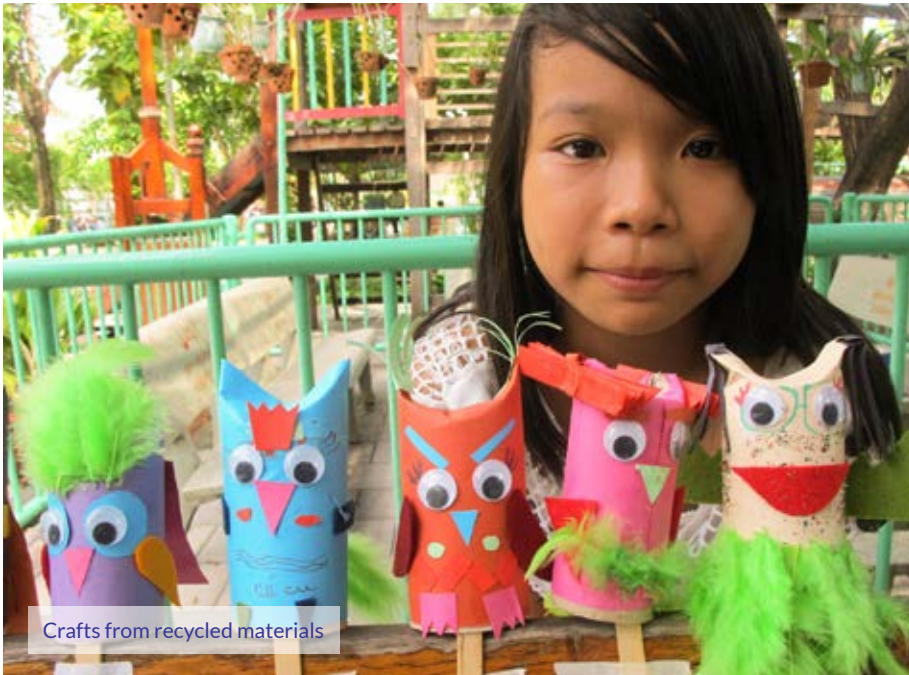
Crafts from recycled materials