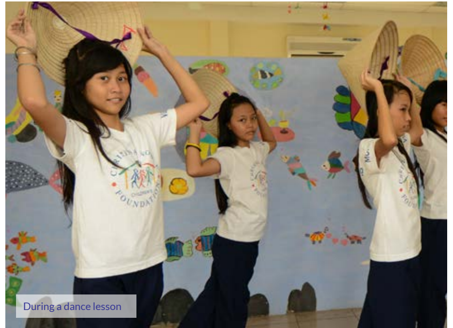
During a dance lesson